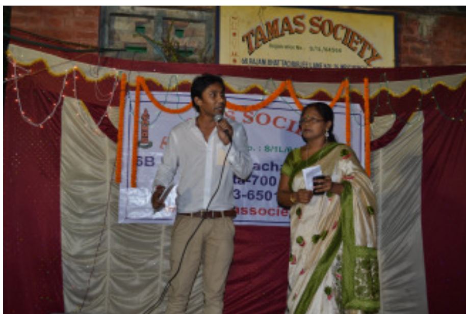
ASST. MANAGER - BHARATIYA MAHILA BANK, Park Street Branch