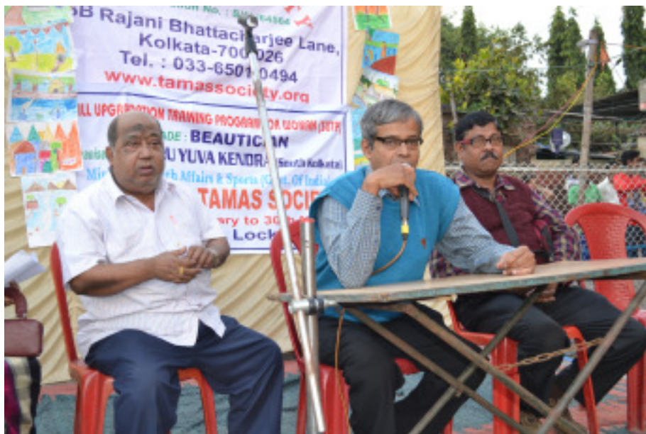
MANAGER - ALLAHABAD BANK, Ballygunge Branch